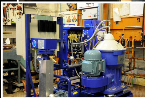
Electro technical lab