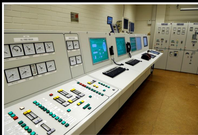
Engine control room simulator