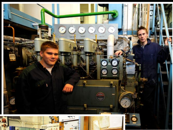
Engine room lab